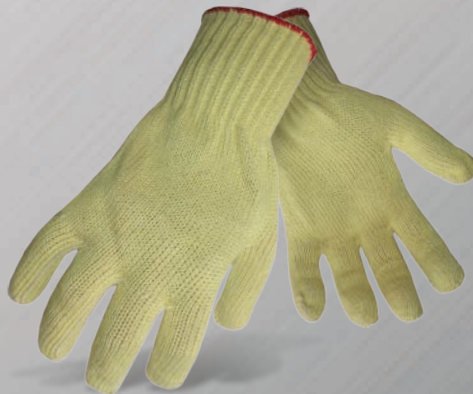
1KK2200 Heavyweight Kevlar Blend Heavyweight yellow Kevlar®blended string knit, reversible, knit wrist. Sizes: S-L Cut Rate: 2