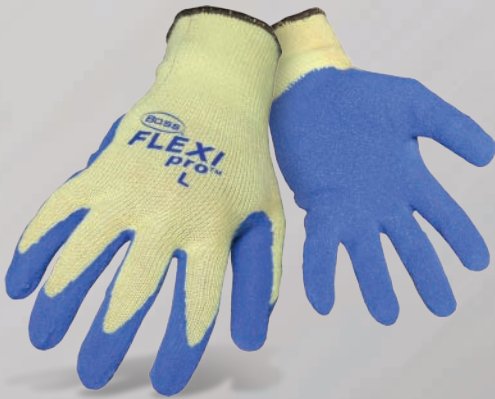
1SR7420 FLEXI Pro™ 100% Kevlar®knit with latex coated palm and fingers, knit wrist. Sizes: S-X Cut Rate: 3