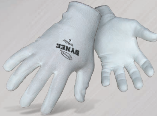
1PU5000 Dynee White White HPPE with polyurethane coated palm and fingers, knit wrist. Sizes: S-X Cut Rate: 2