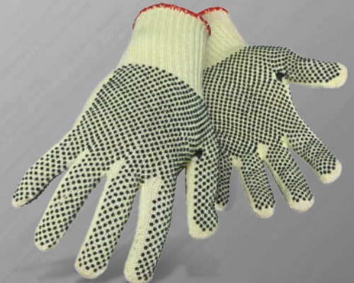
1KK2202 Reversible Kevlar with Dots Heavyweight yellow Kevlar®blended string knit, black PVC dots on both sides, reversible, knit wrist. Sizes: S-2X Cut Rate: 2