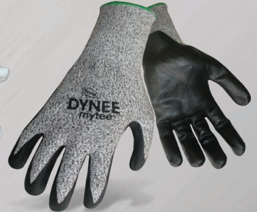
1PU6000 Dynee Mytee™ Extra tough HPPE with polyurethane coated palm and fingers, knit wrist. Sizes: S-2X Cut Rate: 3 1UHD400 Dynee Mytee plus™ Extra tough HPPE with nitrile coated palm and fingers, knit wrist. Sizes: S-2X Cut Rate: 3