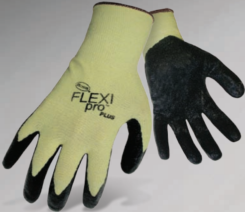
1UH100 FLEXI pro PLUS™ Kevlar®blend knit with foam nitrile coated palm and fingers, knit wrist. Sizes: S-2X Cut Rate: 2

Protection while doing your job shouldn't be an afterthought. At Boss® we believe that it should be a priority. That's why we've created our cut resistant program. If your application involves situations where that extra protection from cuts and abrasions is demanded, we can help.